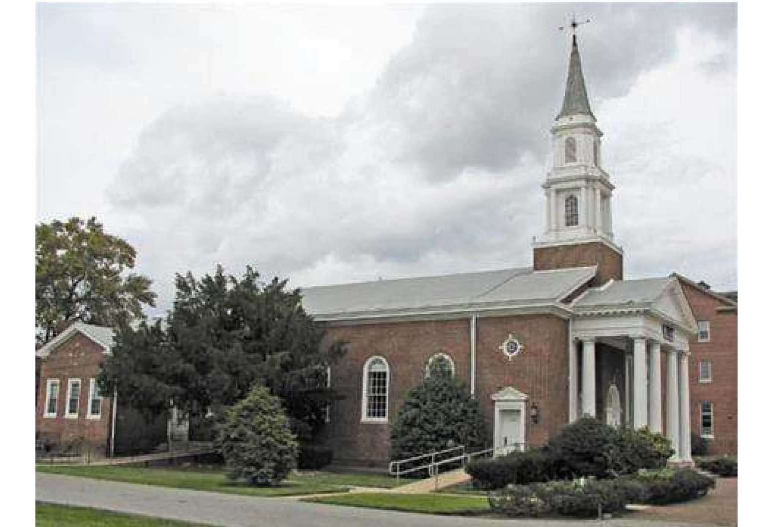
Current home of the Four Chaplains Memorial Foundation is a former Naval Chapel in the South Philadelphia Naval Business Center, Pennsylvania

The organization achieves its mission by advocating for and honoring people whose deeds symbolize the legacy of the Four Chaplains aboard the U.S.A.T. Dorchester in 1943. It’s vision is to impart the principles of selfless service to humanity without regard to race, creed, ethnicity, or religious beliefs. The Four Chaplains Memorial Foundation, a 501(c)3 organization accepts nominations and helps public and private groups honor everyday citizens who have contributed to their community and leaders who have made significant contributions to our nation and the world. For more information about the Four Chaplains Memorial Foundation, you can view our web site at www.Fourchaplains.org , email us chapel@fourchaplains.org or by calling our offices at 215-218-1943.