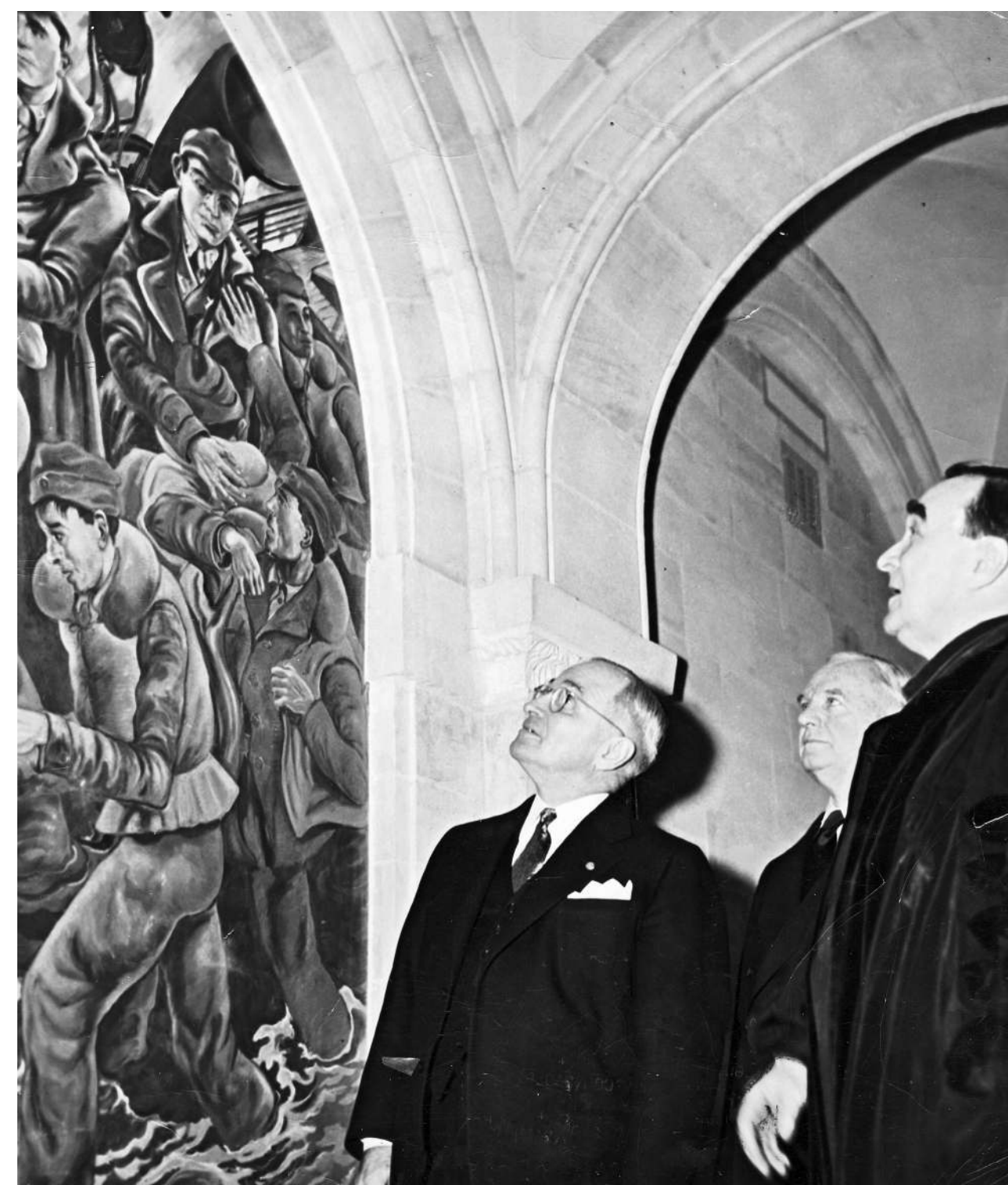
President Truman dedicating the Chapel and the rotating altars of Catholic, Protestant and Jewish faith.