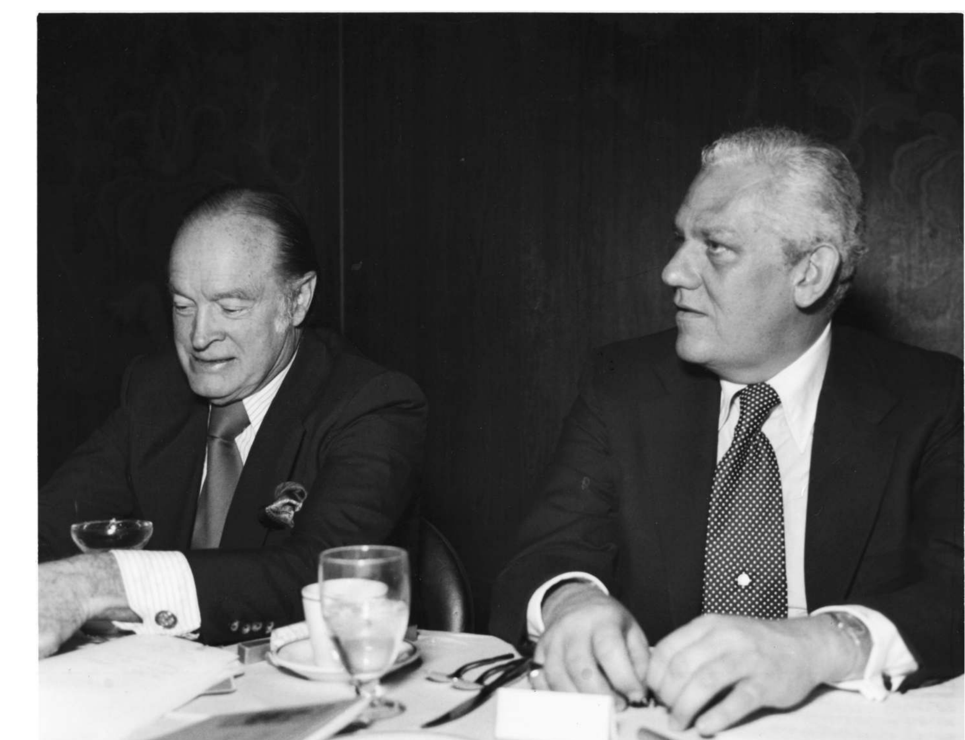
Bob Hope is one of many entertainers and public officials who has received an award from the Four Chaplains Memorial Foundation for their service to their nation.