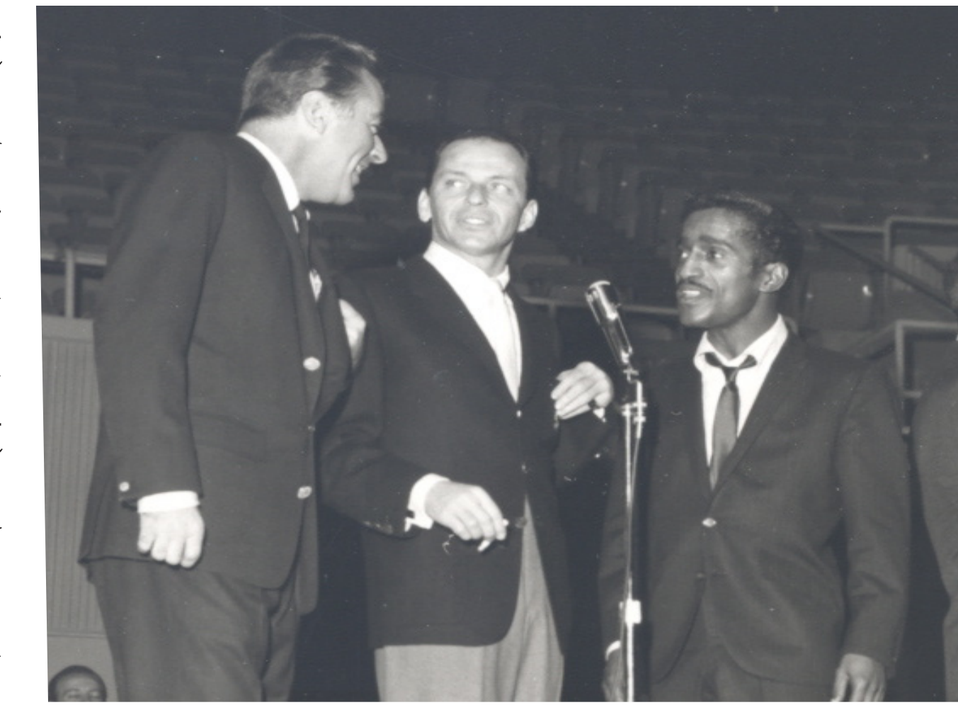
Frank Sinatra, Sammy Davis Jr., and Peter Lawford performing in a Four Chaplains benefit concert.