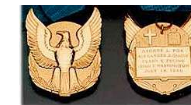
Four Chaplains Medal (1961)

The dedication of the Four Chaplains Memorial Chapel did not end efforts to honor the legacy of the Chaplains. A one-time only posthumous Special Medal for Heroism was authorized by Congress and awarded by the President Eisenhower on January 18, 1961. The special medal was intended to have the same weight and importance as the Medal of Honor.